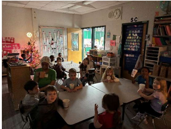
Hot chocolate and star shower kindness party.