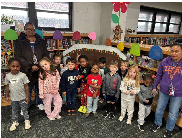
After "ice skating"